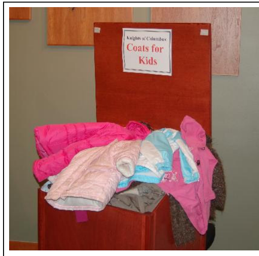
Photo: Over 170 coats were collected over 2 weekends.

Quickly dubbed the "three amigos" our 1st Degree Knights developed a communication plan, collection strategy, worked in creating distribution pipelines, and successfully executed a fairly complex project plan.